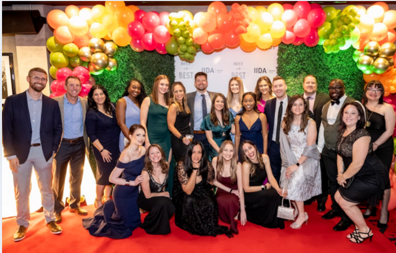
BEST OF THE BEST AWARDS